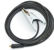
Earth return cable 5 m, 25 mm 2