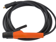
Welding cable 5 m 16 mm 2

The Flexlite TX torches are designed for use with MasterTig welding equipment. The torch range includes several neck models, offering superb cooling performance and good access to challenging joint designs.