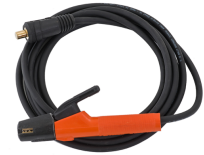
Welding cable 5 m 25 mm 2