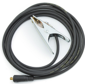
Earth return cable 10 m, 25 mm 2