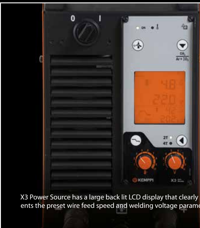
X3 Power Source has a large back lit LCD display that clearly presents the preset wire feed speed and welding voltage parameters.