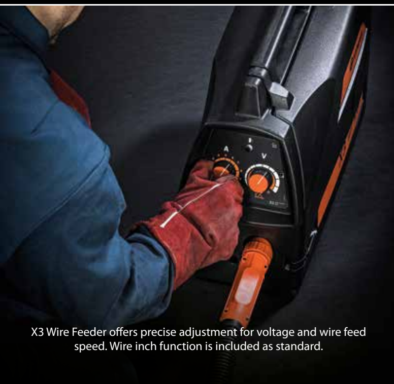
X3 Wire Feeder offers precise adjustment for voltage and wire feed speed. Wire inch function is included as standard.

When working in tough conditions at a construction site, shipyard or a metal fabrication workshop, or doing maintenance welding on a pipeline site in extreme temperatures, you need a companion that you can fully trust on.