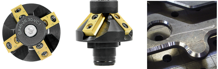
fig. 45°-bevel-milling head with 4 cutting edges and guide roller, equipped with 4 bevel-indexable inserts of type D

For each milling head (bevel, radius), specially coordinated guide rollers are offered. These guide rollers also enable the machining of inner and outer contours and boreholes.