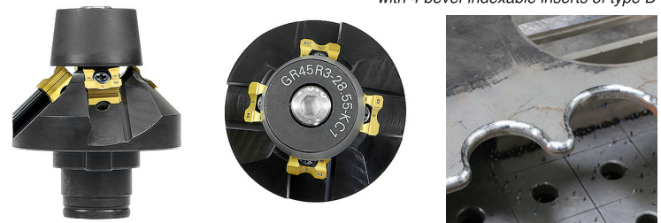
fig. 45°-radius-milling head with 4 cutting edges and guide roller, equipped with 4 x 3 mm-radius-indexable inserts of type R-K