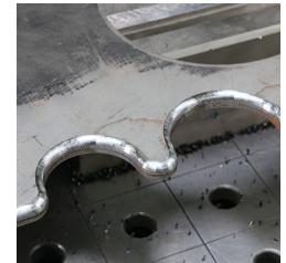
fig. 45°-radius-milling head with 3 cutting edges and guide roller, equipped with 3 x 3 mm-radius-indexable inserts of type R-K