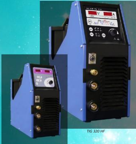
Stick 320 LA-V